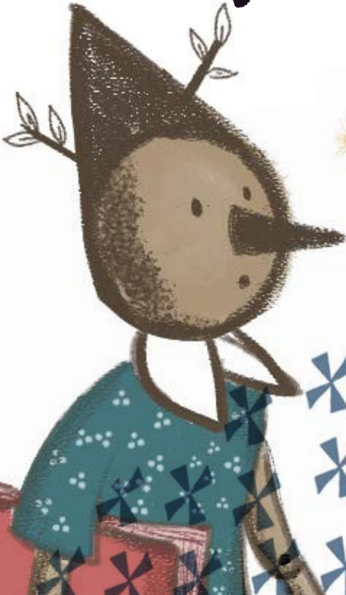
Illustration: Aspasia Xydea